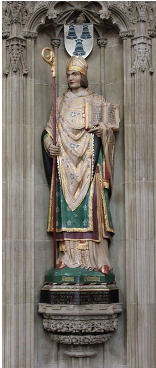
St Osmund, Bishop of Salisbury

He was declared to be a saint in 1457, the last Englishman until John Fisher and Thomas More were canonised in 1935.